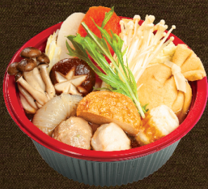
鍋肴野菜鍋 Assorted Pot Dishes and Vegetables Shabu Shabu