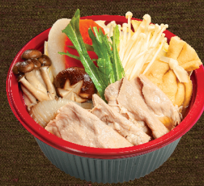
丹麥豚梅肉野菜鍋 Danish Pork Collar and Assorted Vegetables Shabu Shabu