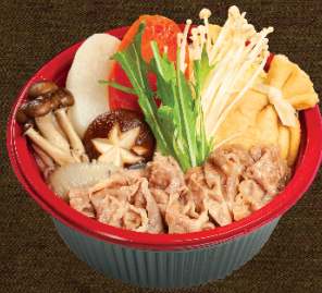
美國牛腹胸肉野菜鍋 US Short Rib and Assorted Vegetables Shabu Shabu