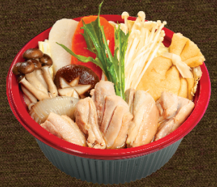
丹麥雞腿肉野菜鍋 Danish Chicken Thigh and Assorted Vegetables Shabu Shabu